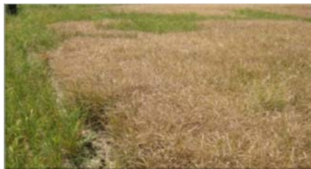
Fig. 2. Rice seedling bed under drought in Yemathin Township

on agriculture, health and basic infrastructure; and (iv) Forest degradation leads to loss of fuel, food, medicine and increased workloads.