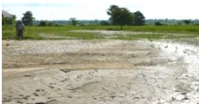
Fig. 1. Rice fields covered with sand in Pakokku Township

income; (ii) Water shortages lead to increased workloads to collect water, and lead to decreased agricultural production; (iii) Climate change leads to negative impacts