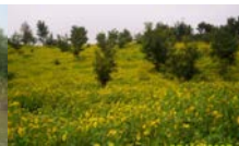
Fig. 9. Agroforestry in southern Shan state

In all study areas, the disappearance of forest trees is clearly visible. The underlying causes are the long time over-exploitation of timber and fuel wood, encroachment of agriculture and settlement and etc (Fig. 7).