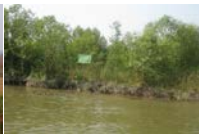
Fig. 8. Community Forests in Delta areas