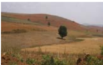
Fig. 7. Agriculture encroachment in hill tops in Shan state

Concerning with the awareness and perception on climate change impacts on their daily life, more respondents in all regions noted worse weather and negative trends in availability of drinking water for man and animals, Non-timber Forest Products (NTFP) and fuel wood (Table 3A, B and C). All respondents felt that crop fertility had worsened or was, at best, unchanged in recent years; none felt it had improved. There were similar findings for crop yields. The vast majority stated how it was increasingly difficult to obtain wood and NTFP from forests, how the number of trees in forests was declining, and how fish catches were going down. These show that livelihoods are already becoming increasingly precarious. Although responses related to climate change were unclear, the only stated strategies to cope with climate change and environmental shocks were: to take out loans, to grow alternative crops, and to sow crops later. These findings reveal that rural livelihoods highly dependent on natural resources such as forests, land, fish, water and a stable climate- there are currently few alternatives to adapt to environmental shocks. Since the climate change impacts are becoming more and more evident, Myanmar urgently needs to adapt climate change impacts on its key socioeconomic sectors and communities. Incorporating the adaptation strategies into the development plans and policies will enhance the country to achieve its main goal of poverty alleviation.